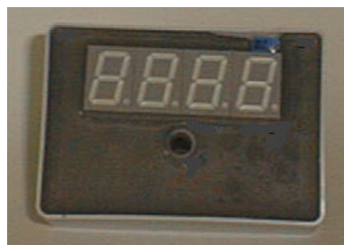
Instrument box 73x52mm Depth 21 mm