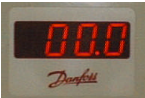
Panelmount with DANFOSS brand front lens.

The display is supplied with 2,6 meter cable. Front cover, Front lens, stainless steel screw, washer and nut. Cable length according to customers need.